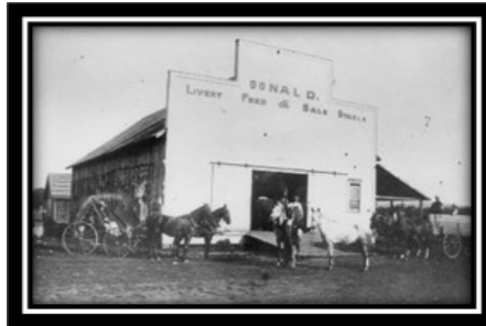
Donald Livery, Feed & Sales Stable