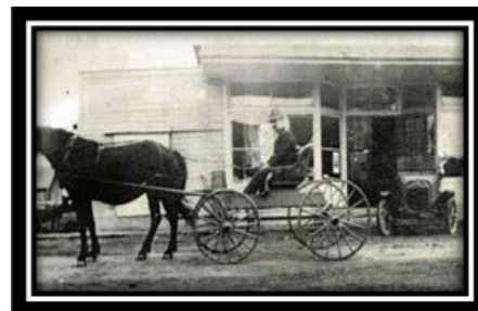
Marty, Carver & Groff store (now Donald Tavern)