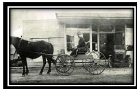
Marty, Carver & Groff store (now Donald Tavern)