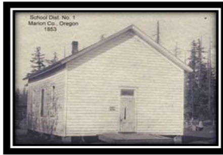
1 st Schoolhouse 1853