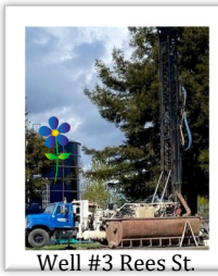
Well #3 Rees St.

We have a lot to be thankful for and proud of in this community as we continue to build our resume of successes. Collective spirit, positive thinking, and a can-do attitude will certainly boost our positive momentum as we charge into the future.