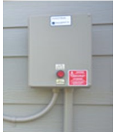
Sewer Alarm Box

In the event your sewer alarm sounds, please call the emergency pager number immediately at 503-301-6479 . By calling City Hall or waiting to call the emergency pager, you are delaying the response of Public Works to resolve the issue. There is a Public Works crew member on call 24/7, ready to respond. This service is provided as part of your monthly utility bill. The pager number is listed on a sticker on the sewer alarm box, on the City's website, on your monthly utility bill and printed on the back page of every edition of the monthly newsletter.